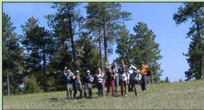
Wilderness Trekking School