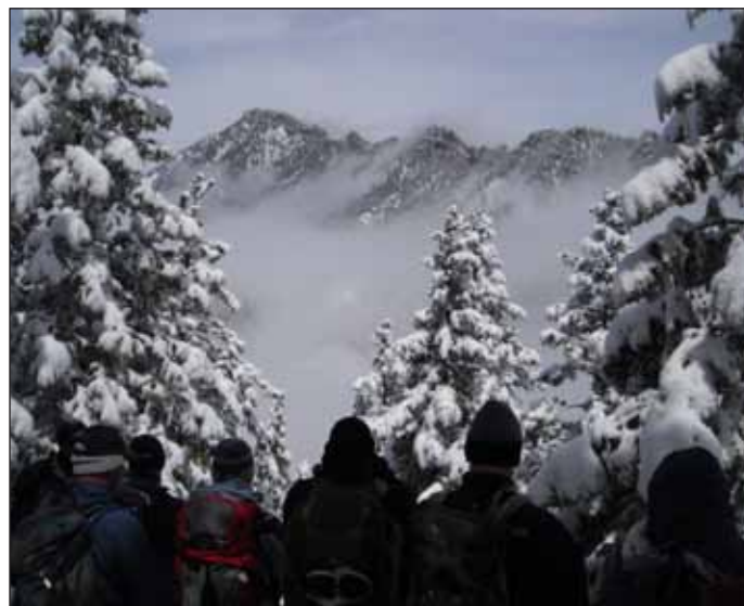
Dry Land Travel Day, Eldorado Canyon, 5/12/2011 (Unexpected snow fall the night before changed Dry Land Travel into Snow Travel.)