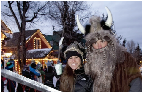
Breckenridge Ullr Fest